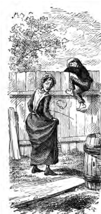
AUNT POLLY BEGUILLED.

“Hang the boy, can’t I never learn anything? Ain’t he played me tricks enough like that for me to be looking out for him by this time? But old fools is the biggest fools there is. Can’t learn an old