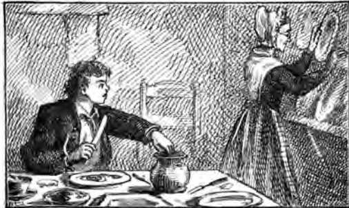
A GOOD OPPORTUNITY.

Tom did play hookey, and he had a very good time. He got back home barely in season to help Jim, the small colored boy, saw next-day's wood and split the kindlings before supper—at least he was there in time to tell his adventures to Jim while Jim did three-fourths of the work. Tom's younger brother (or rather half-brother)