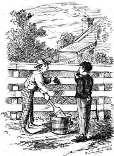
AIN’T THAT WORK?