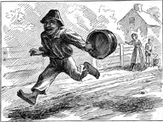
TENDIN' TO BUSINESS.

absorbing interest while the bandage was being unwound. In another moment he was flying down the street with his pail and a tingling rear, Tom was whitewashing with vigor, and Aunt Polly was retiring from the field with a slipper in her hand and triumph in her eye.